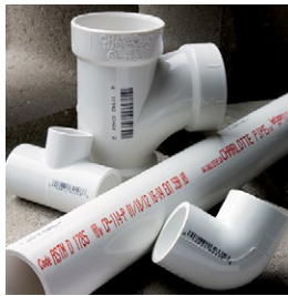
Continuous inkjet codes

Videojet coding solutions are designed to help manufacturers print the highest quality codes while maximizing efficiency and minimizing unexpected downtime.