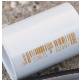
Laser code (color change)

Printed codes and marks are often the most visible indicator of your brand values and product quality. The legibility and appearance of logos, production and time stamps, bar codes and other marks can all contribute to perceived quality.