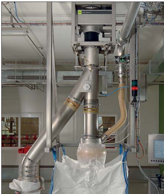
Installation example: IFS compliant metal detection directly before the filling of spice products into bigbags. (old version)

For detailed information please request our technical data sheet, or contact our experienced Sesotec sales consultants - by telephone or at your place.