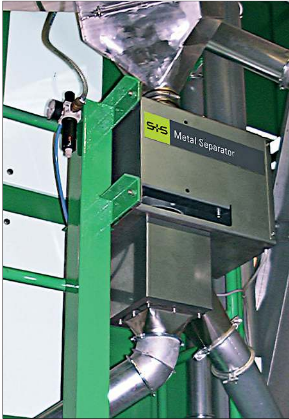
Installation example: Metal separator RAPID 4000-FS used for quality control at a filling station for dried vegetable (old version)