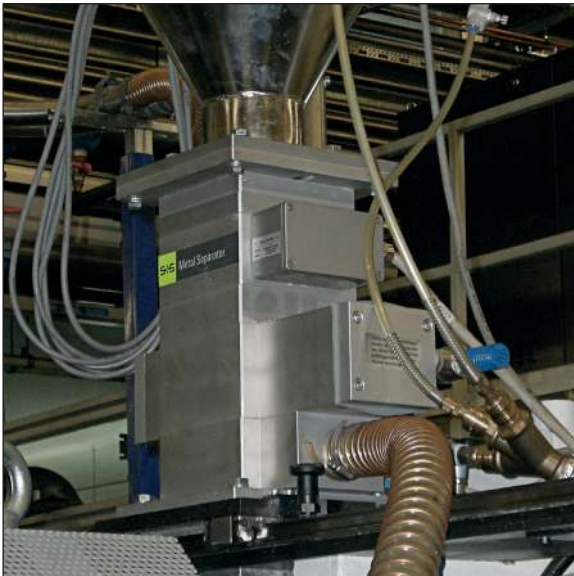
Installation example: Metal separator PROTECTOR installed over the feeder of an injection moulding machine (old version)

It detects all magnetic and non-magnetic metal contaminants (steel, stainless steel, aluminium, etc.) – even when they are enclosed in the product. Metal contaminants are ejected via the “Quick-Flap” separation unit.