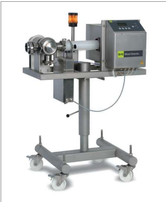
LIQUISCAN PL with height-adjustable stand