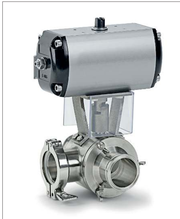
Separating system: Ball valve