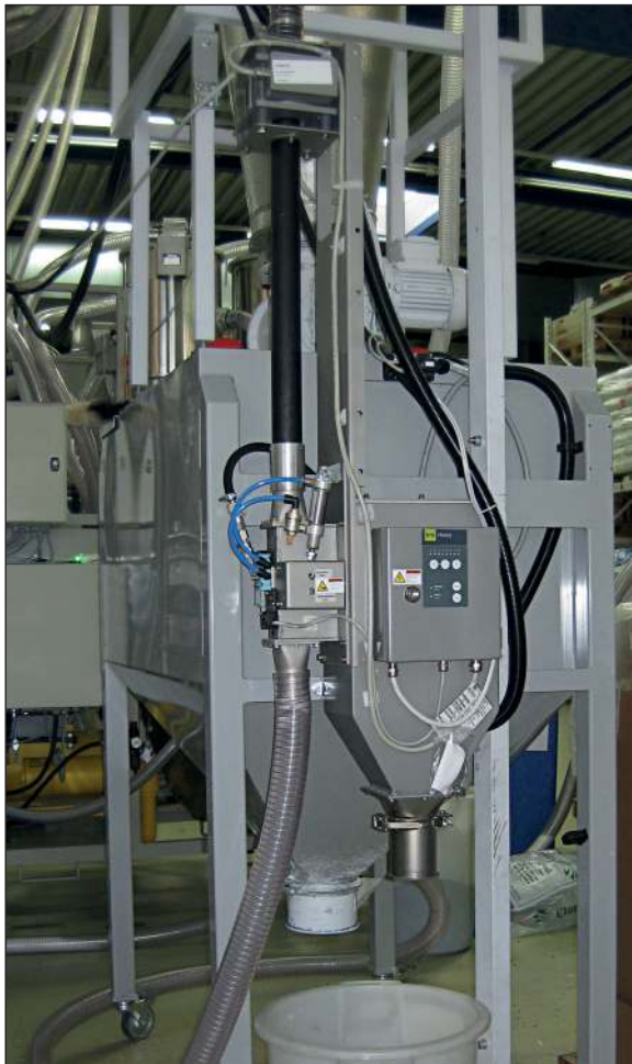
Installation example: Metal separator GF installed in a vertical pipeline (old version)

It detects all magnetic and non-magnetic metal contaminants (steel, stainless steel, aluminium, etc.) – even when they are enclosed in the product. Metal contaminants are ejected via the “Quick-Flap” separation unit.