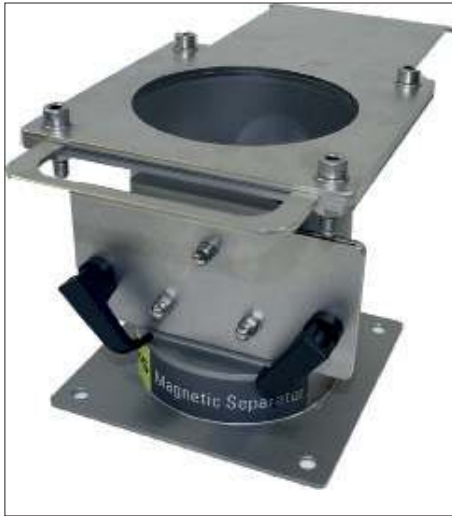
Design example of the EXTRACTOR-SE with slidegate.