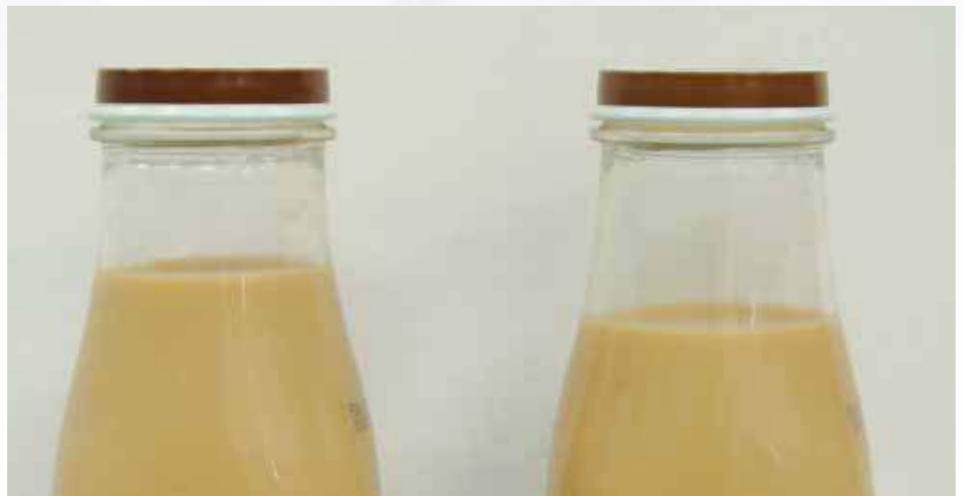
Full container (left), underfilled container (right).

X-ray technology is used to measure the product fill level in steel, aluminum, glass, plastic and paper containers. An X-ray tube energized at high voltage is used to produce a low energy X-ray beam. This X-ray beam is focused to look through the container in the expected fill level region. As the X-ray beam penetrates the container, it is attenuated by the amount of product blocking the beam. The beam is monitored by a scintillation detector, which counts the X-ray intensity after it goes through the container. The level of intensity is proportionate to the fill level of the container. User set rejection limits defines the high or low fill threshold.